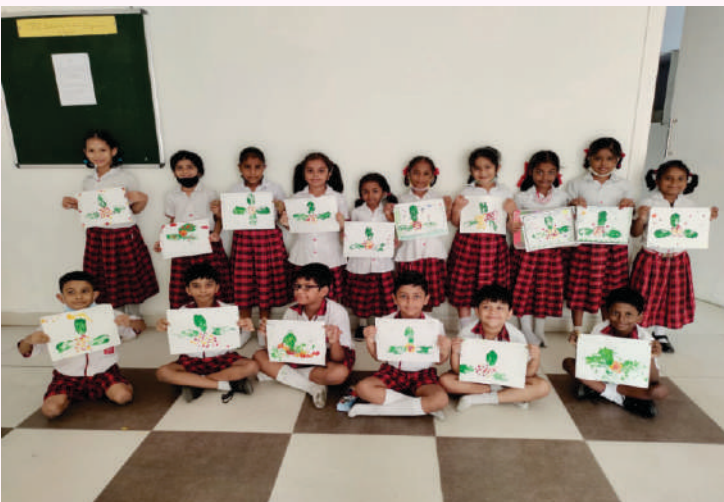
Grade II B Artwork