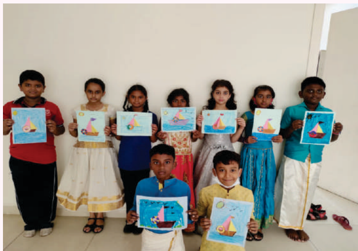
Grade 5B Artwork