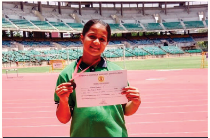
Amrithavarshini 7B SHOTPUT